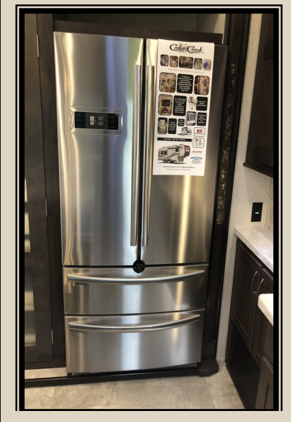
- Option -20 cu. ft. refrigerator, double drawer with icemaker

"A customer's best buy is talking to the right person"