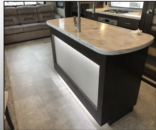
The kitchen remodel is complimented with a redesigned island that includes LED rim lighting