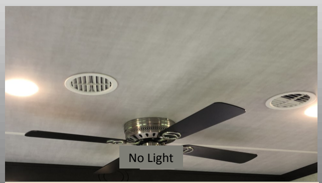
Hathaway Edition now has a flat ceiling design New ceiling panels give a softer accent