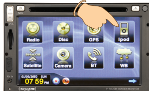
Touch Screen to Activate Controls