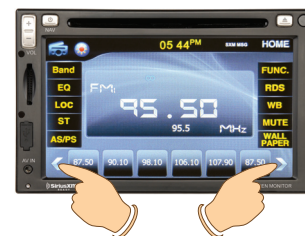
Tuning in a Radio Station