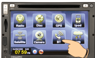
Making or Answering a Call