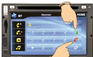
Ending a Call