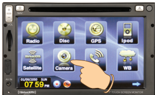
Manual Camera Selection Buttons

The front view camera can not be automatically activated. The front view camera can only be manually selected, touch the screen to reveal the buttons for manual camera selection.