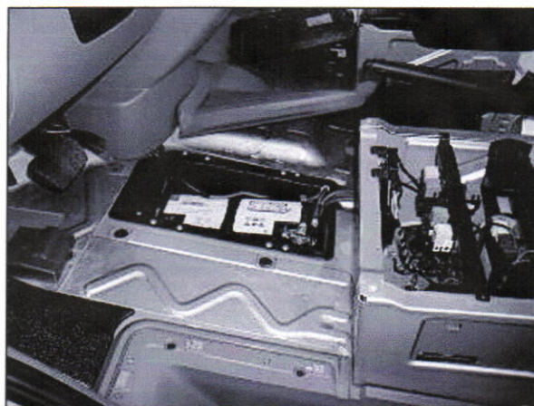
Starter Battery (under driver floor)

Do not use aux battery as a start aid. Using an auxiliary battery as a start aid may lead to severe damage to electrical components.