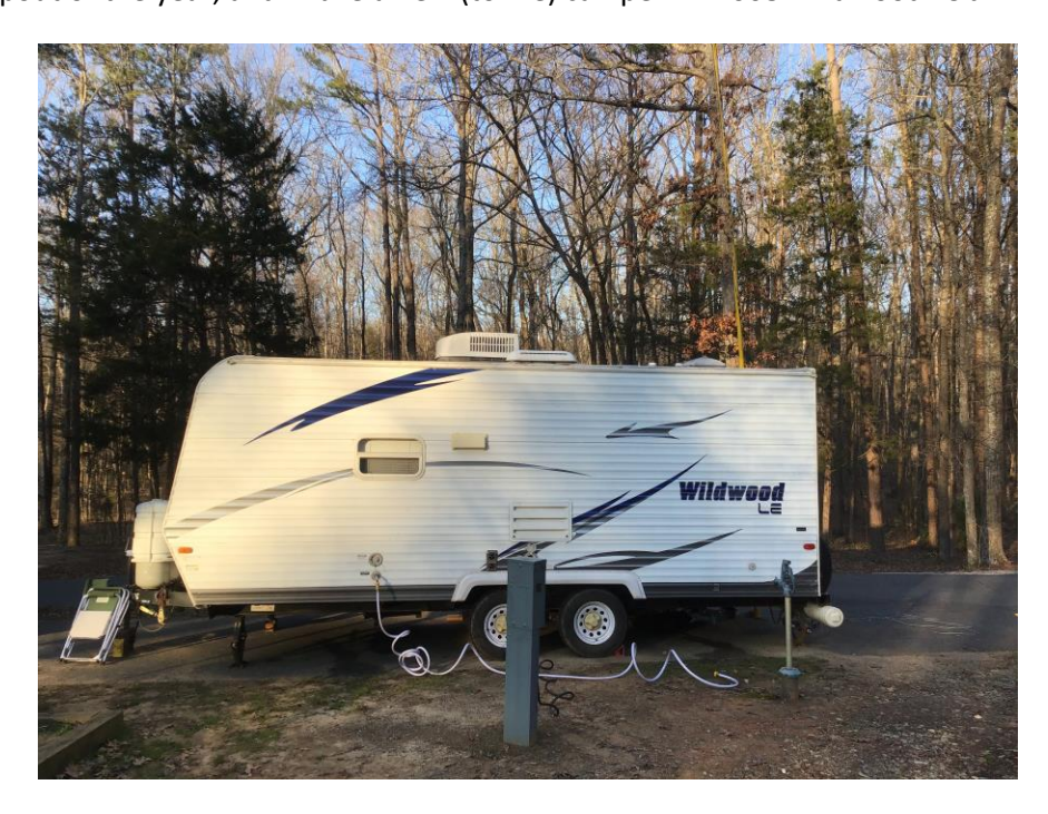
I made a mount on the rear bumper for the Hastings Telescopic pole I use.

My first campout of the year, and I have a new (to me) camper. A 2008 Wildwood 19bh.