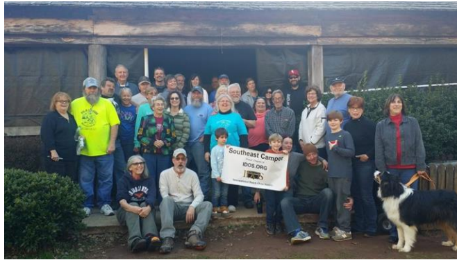
Attendees at Cabin Fever 2019

Cabin fever and Fall Dogs are held at Andrew Jackson State Park, Two State is held at Jordan Lake State Park in conjunction with the Virginia group, Mile High DOG is held at Mile High Campground at Maggie Valley NC in July. The Spring DOG is held at Kings Mountain State Park.