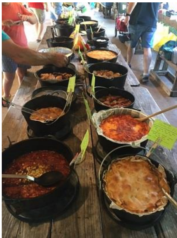
Main dishes other end