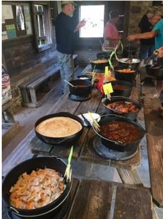
Main dishes one end